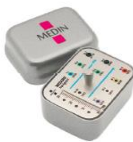
Cassette and stand for WIZARD Navigator without instruments

Caja y organizador para WIZARD Navigator sin instrumentos