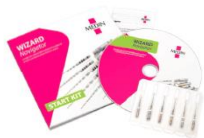
Start kit WIZARD Navigator basic set L25 + video + instructions

Start kit WIZARD Navigator kit básico + vídeo + instrucciones